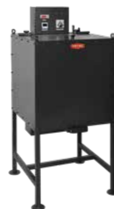
SDF8 Digitally Controlled Stationary Process Single Tank Drying/ Baking Flux Oven 80 Kg capacity, Temperature ambient-370° C digital