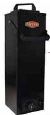
IQ15 Portable welding Rod Oven Double Chamber 11 Kg capacity, Adjustable Temperature 50-200° C