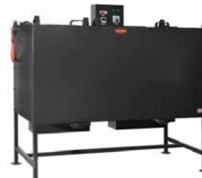
SDF40 Digitally Controlled Stationary Process Double Tank Drying Baking Flux Oven 400 Kg capacity, Temperature ambient-370° C digital